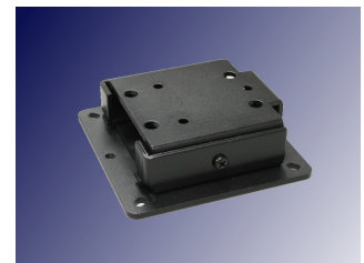
Surface Mount Bracket back view

The M1 Series Surface Mount Bracket offers a simple, secure and stable way to attach your LCD panel to a wall or vertical surface. The extra slim bracket design allows your LCD panel to be mounted only 1 inch (25mm) away from the wall. Our Quick Release mounting design makes your installation easy and secure. The full steel construction provides strength and stability for panels weighing up to 44 lbs. (20kg). The combined VESA 75/100mm standard plate is included.